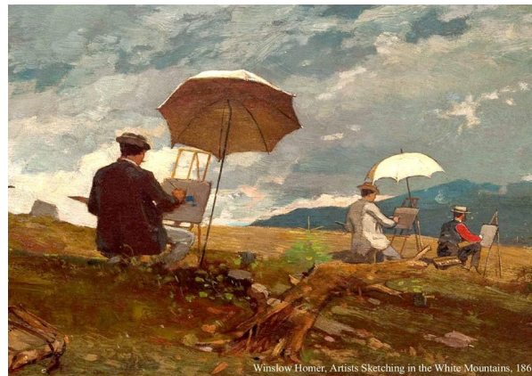
Winslow Homer, Artists Sketching in the White Mountains, 1860

2 nd Annual Bonne Soirée Peeler Art Center Friday, April 26th, 7-9 p.m. Art inspired by the DePauw Nature Park • readings • live music • cash bar • auction of original works • light hours d'oeuvres & sweets greencastle ARTS COUNCIL PUTNAM COUNTY